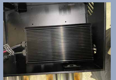
Built-in charger, charging is more convenient