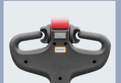
The upright-tiller running function allows it to work within confined space, such as container