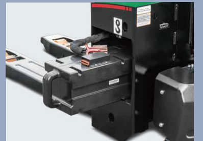
Easy for exchanging battery