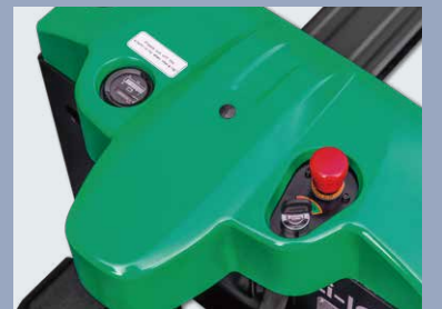
Body feature smooth lines and affluent sense of movement, and compact profile, in accord with the latest appearance design trend